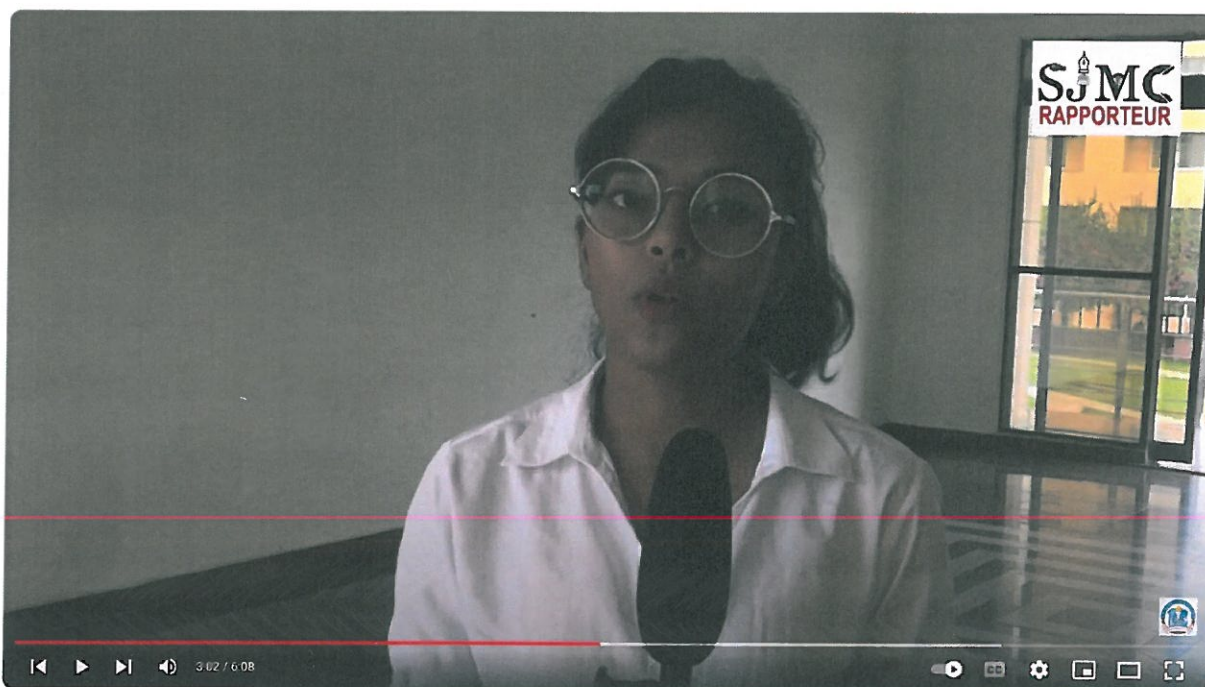
#SJMC Rapporteur 2, the weekly news bulletin of K.R. Mangalam University